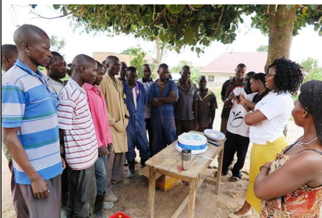
HAPPY NEW YEAR FOR THE ENTIRE CONSTRUCTION TEAM WITH ALL WORKERS