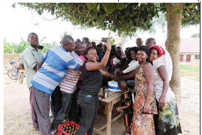
WITH TEAMWORK IT IS A PIECE OF CAKE TO CUT THE CAKE