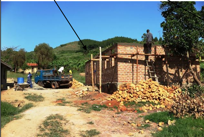
Nursery Class Rooms

The right arrow points to the Kitchen just started before Christmas. Today on the 30 th of December the workers have started raising the walls (lower picture right).